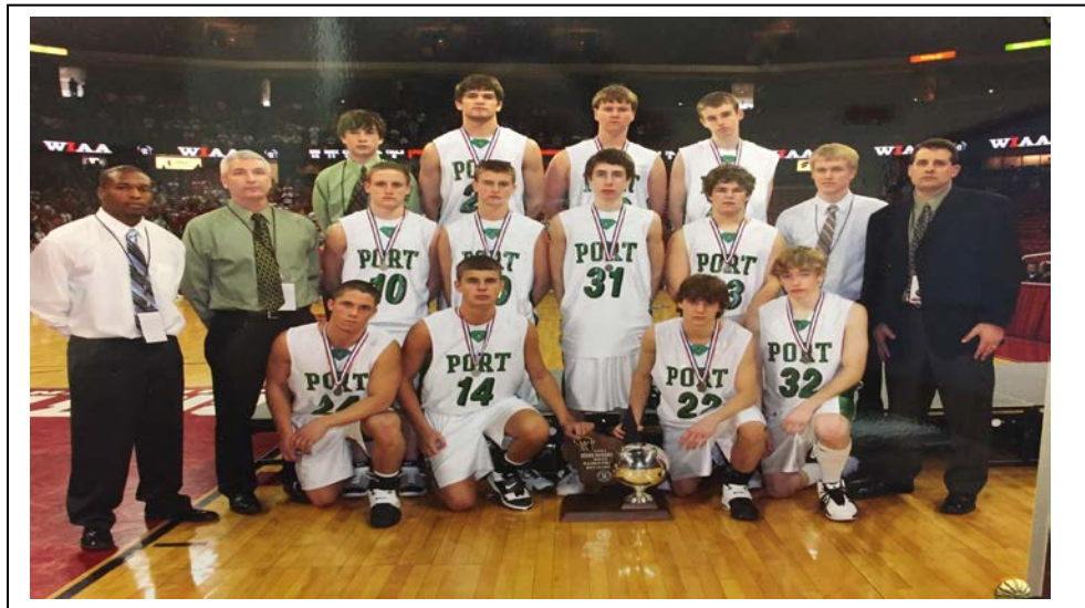
Receiving their State Runner-Up trophy in Madison!