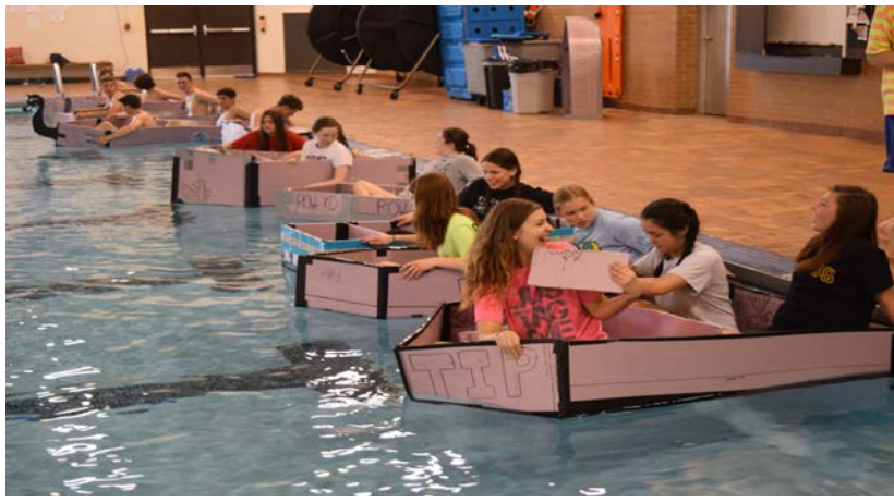
Physics Boat Races!