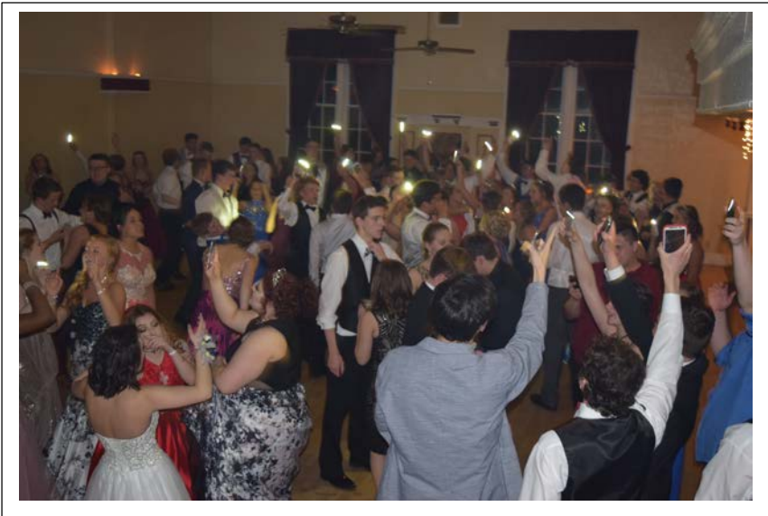
Fun at Prom