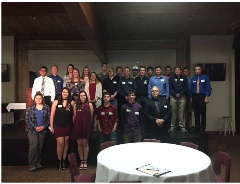
Youth Apprenticeship 2017