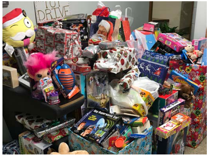
Kapco Toy Drive—Awesome Job PWHS Students!