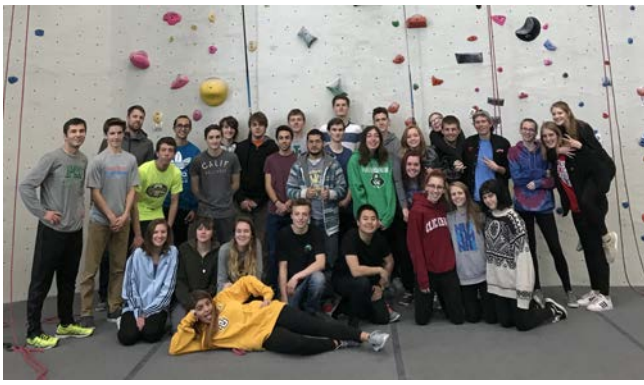
Outdoor Education trip to Adventure Rock in Milwaukee