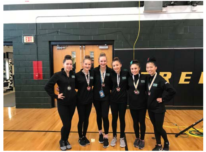
Dance Team Solos from the Freedom Dance Classic