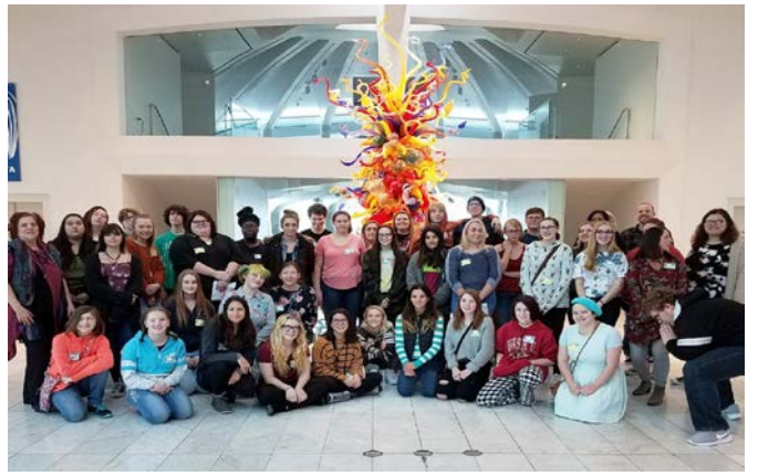
Milwaukee Art Museum Field Trip