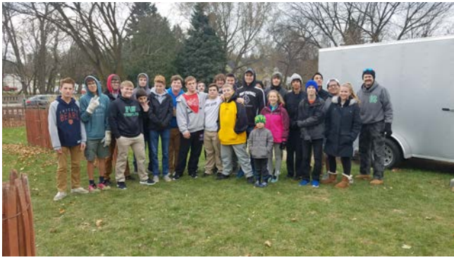
Students donated their time and helped unload Christmas trees!